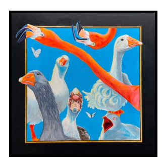
The Great Escape