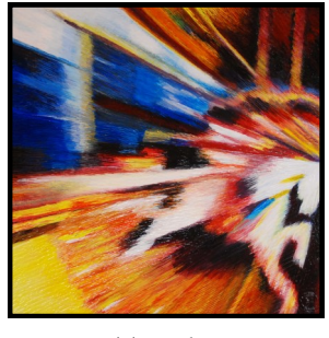
TJ Oxley Merry Go Round

"Beatitude's Vision of Possibilities" a 2-person exhibit at Beatitudes Campus Through January 27 at 1610 W. Glendale Ave, Phoenix