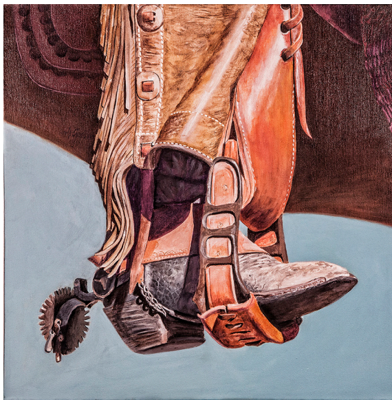
1st Place The Ride Aileen Garvey